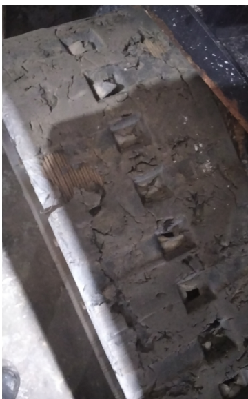
Tyre Condition 4