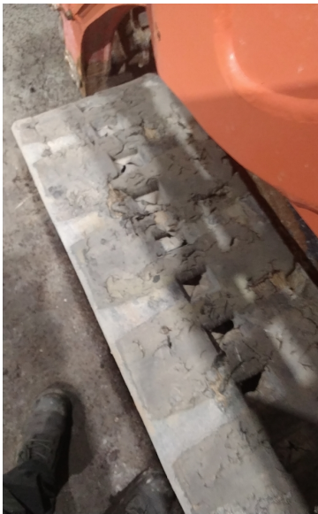
Tyre Condition 4