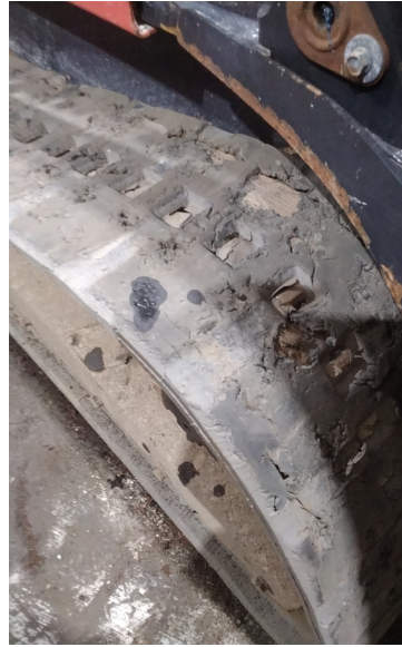
Tyre Condition 1